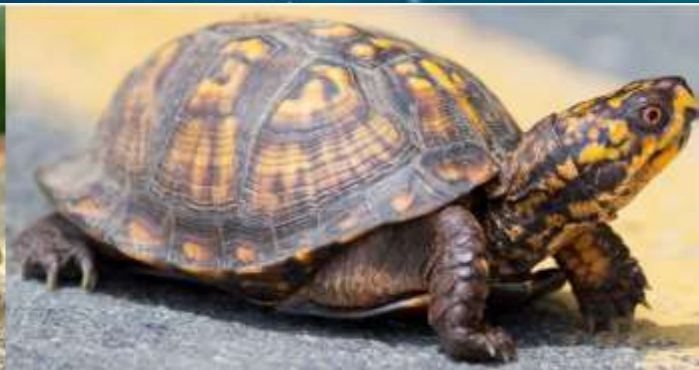
← Eastern Box Turtle Terrapene carolina ssp. carolina [Species of *SPECIAL CONCERN*]