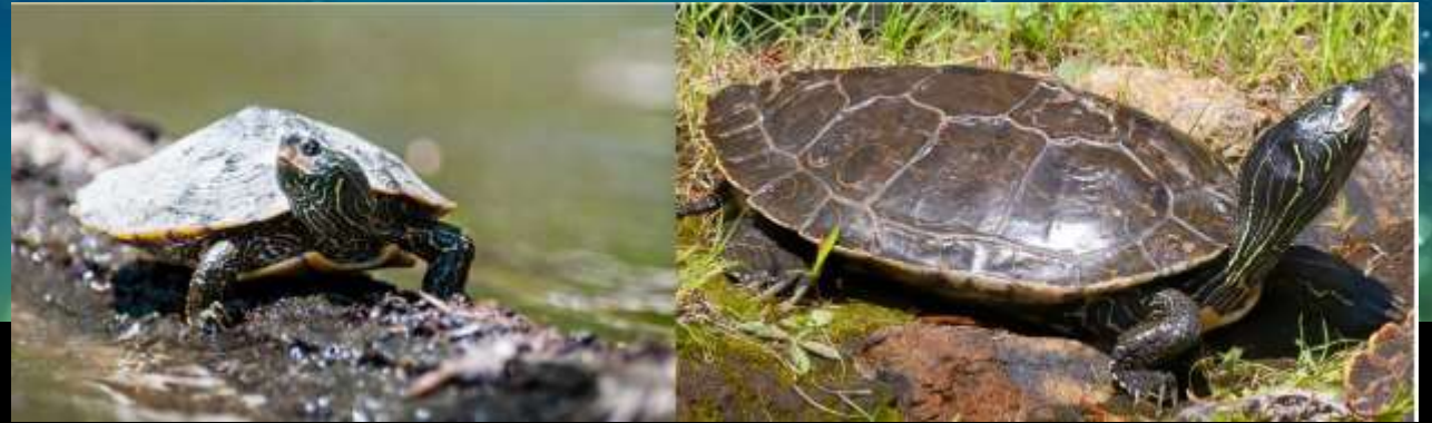
← Common Musk Turtle Sternotherus odoratus