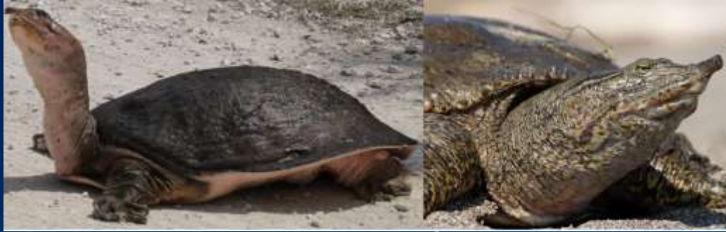
← Spiny Soft-Shell Turtle Apalone spinifera