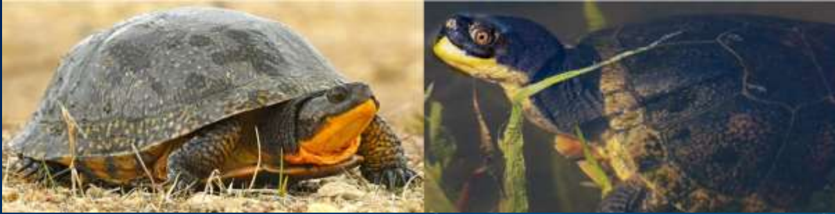
← Blanding's Turtle Emydoidea blandingii [Species of *SPECIAL CONCERN* ]