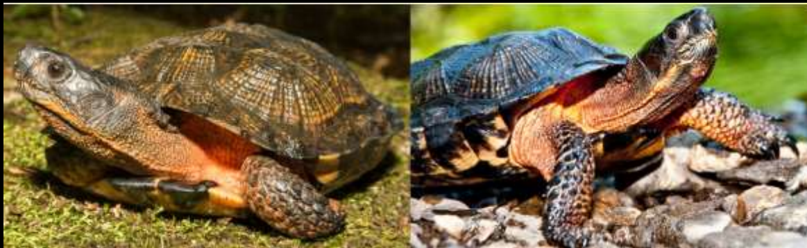
← Wood Turtle Glyptemys insculpta [Species of *SPECIAL CONCERN*]