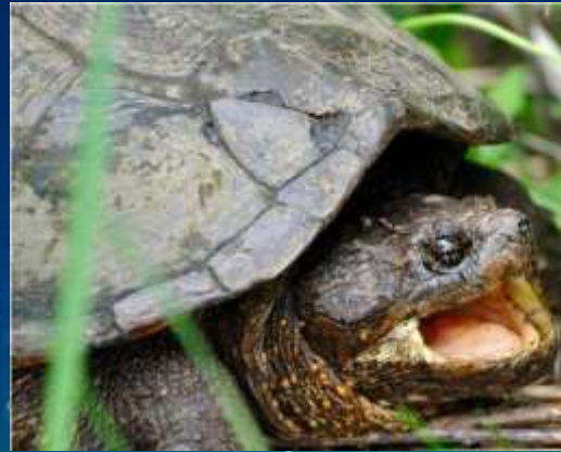
Common Snapping Turtle → Chelydra serpentina