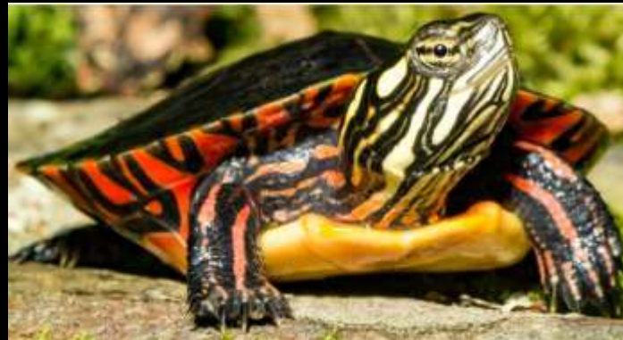
Painted Turtle → Chrysemys picta